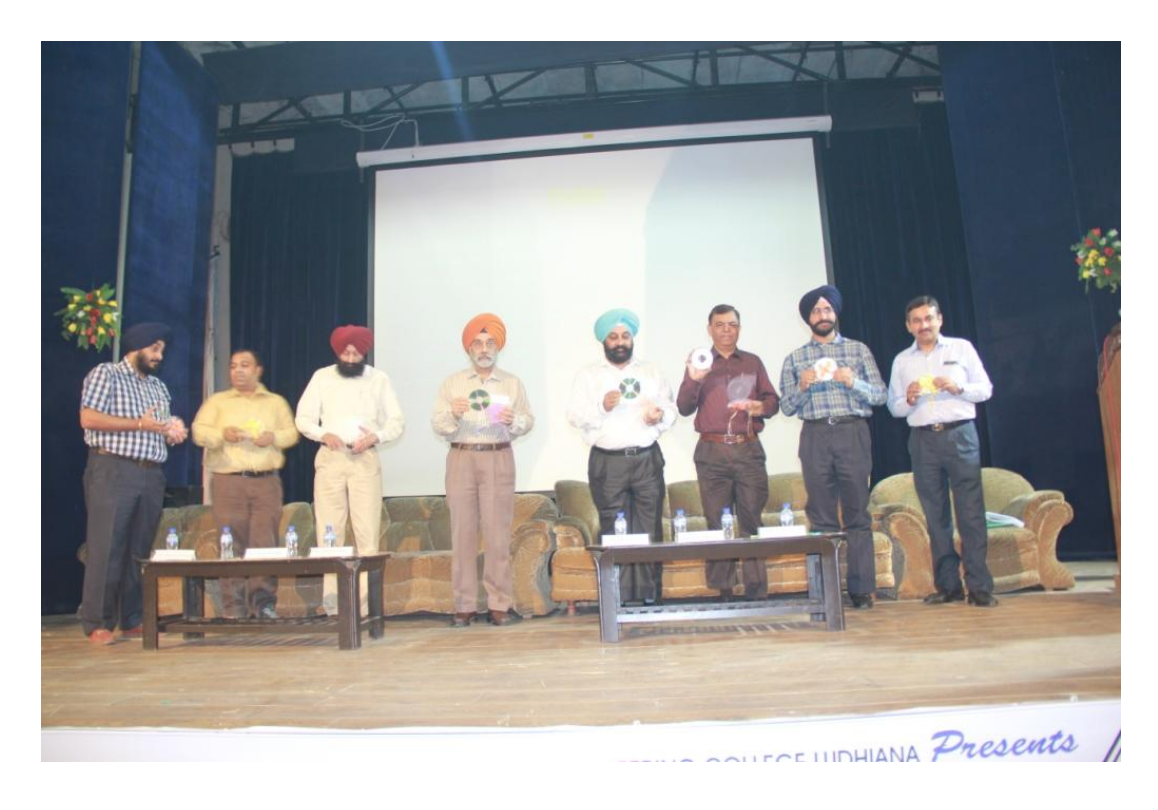
Dignitaries Releasing Proceedings of eVision'16