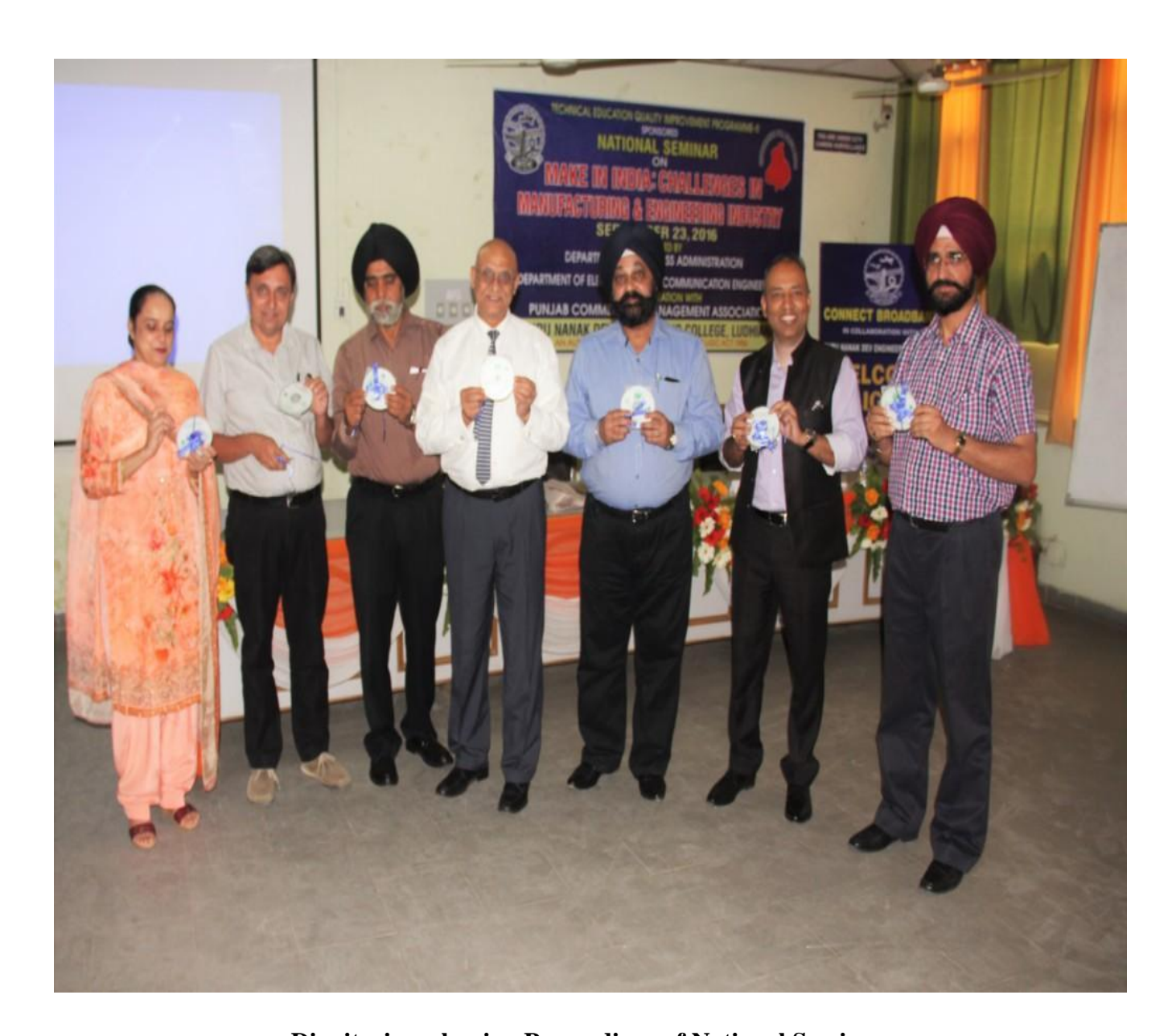
Dignitaries releasing Proceedings of National Seminar

The prime intent behind this seminar was to provide an opportunity to the participants to learn and appreciate the technology options, challenges and opportunities in Engineering as well as Manufacturing industries. There were around 60 Faculty members and Research Scholars from different organizations who presented their research on new ideas, products, or theories related to the theme of seminar.