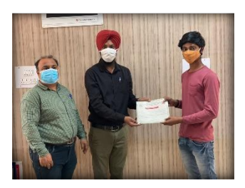
Certificate Distribution Ceremony.