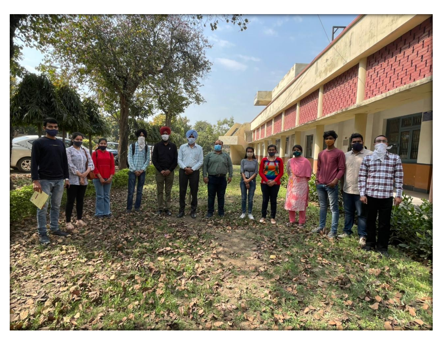
HOD-ECE, Faculty Head IETE-GNDEC with winners and Organizers.